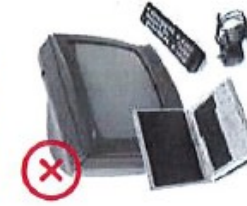
No electronics For recycling drop-off locations visit calgary.ca/electronics