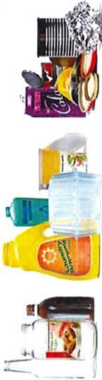
Containers made of glass – Food jars and bottles

Containers such as jugs, bottles, cartons, cans and other rigid containers.