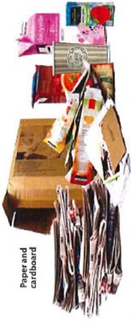
Paper and cardboard

See special instructions below for items such as shredded paper and bundled plastic bags.