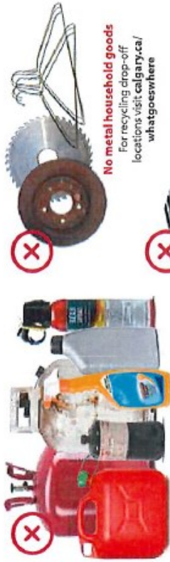
No metal household goods For recycling drop-off locations visit calgary.ca/whatgoeswhere

Keep our workers and equipment safe by leaving these items out of your recycling. They can injure a worker, damage equipment, cause a fire at the recycling facility or spoil the quality of good recyclables.