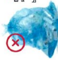
No bagged recyclables Except for a bag that contains shredded paper, or a bag that contains other plastic bags, bubble wrap and plastic wrap.